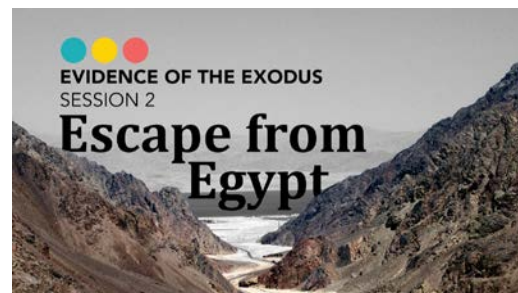
Some of the videos and clips we released this month on evidence4faith.org/courses