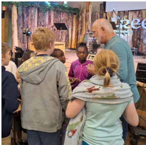
Interacting with the children at Silver Birch Ranch after an interactive lesson on Biblical Archaeology