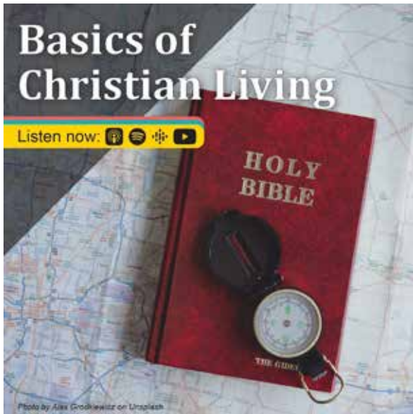
Did you catch our latest podcast series? Listen to it now at evidence4faith.org/courses