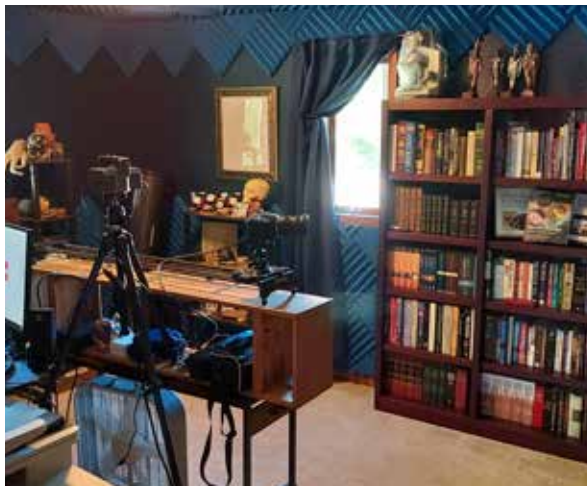
The set is almost done!