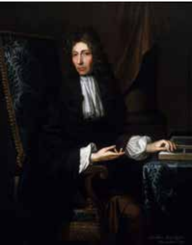
Sir Robert Boyle