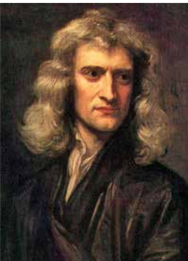
Sir Isaac Newton

How does Mt. St. Helens support Catastrophism and a young earth?