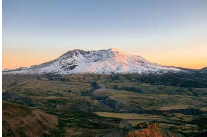
Mount Saint Helens today.