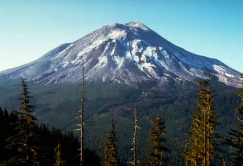
Mount Saint Helens one day prior to the eruption.